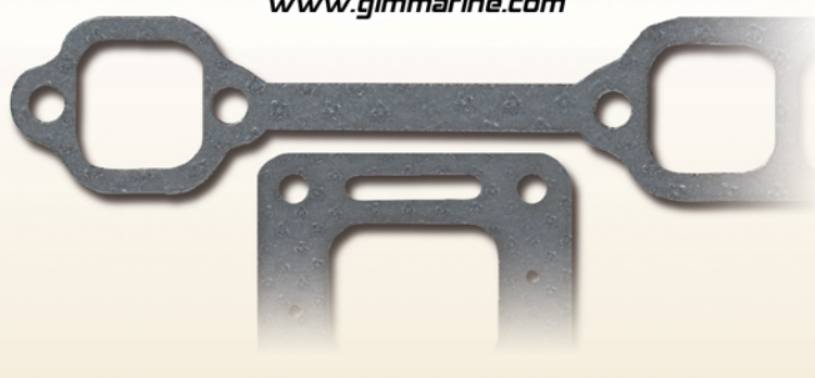
Manifold & Elbow Gaskets

Made from a compressed material with synthetic fibers & binders. It has a distinctive green color and is extremely thin. It has a low temperature range & is used in refrigeration compressors & brake units mostly.