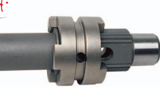
Lugs seat all the way down, passed the ledge of the Prop Shaft.