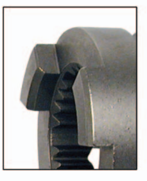
Notice bevel cut and No splines on the lugs.